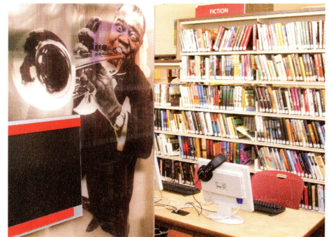
The renovated Alvar Library

YOU CAN HELP OUR LIBRARY. TO FIND OUT HOW, SEE THE REVERSE SIDE OF THIS SHEET, OR CONTACT: